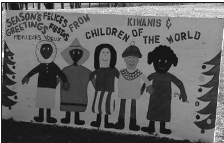
View the Division 12 Kiwanis Clubs display at the Festival of Lights in Sinnissippi Park this holiday season

Our display is located at the top of the hill in front of the practice green and clubhouse of Sinnissippi Park. Festival of Lights viewing is as follows: Wednesday through Sunday, November 30th through December 31st, 6:00 p.m.-10:00 p.m.